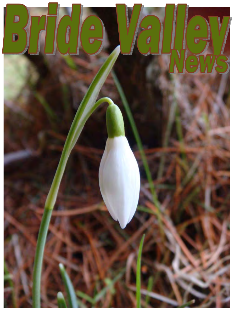
The Magazine of the Bride Valley Churches February 2014